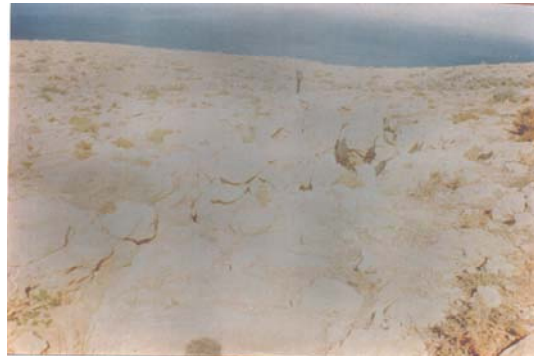
Fig. 4 – Fissures observed in Carabonita terrain..