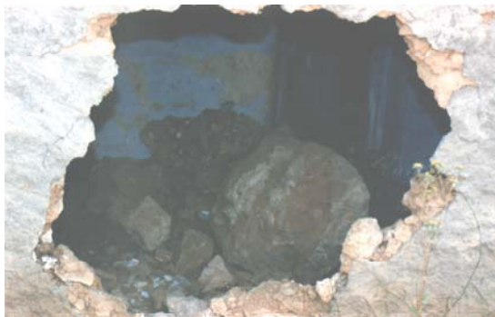
Fig. 5 – Wall destruction caused by rock fall in Douar Tafensa..

In the whole region of the epicentral zone many rocks fell from the mountainous terrain, and in many cases added to the extent of the damage suffered by the buildings especially in Douar Tafensa (Fig. 5 and 6).