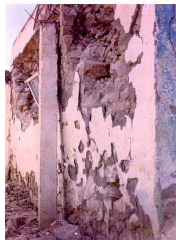
Fig. 8 – Few displacement of the wall in Douar Rwadi.