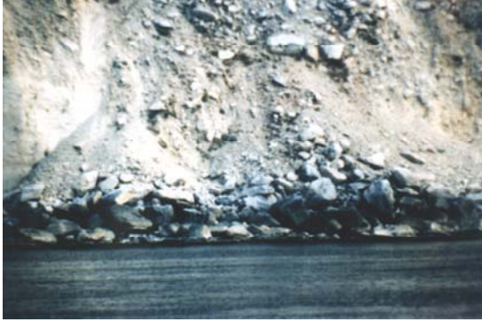
Fig. 2a- Soil falls in the coast cliffs of the Mediterranean Sea west of Al-Hoceima city.