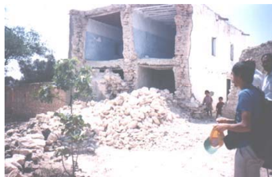
Fig. 6 – Adobe construction strongly affected by earthquake in Douar Tafensa.