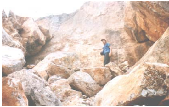
Fig. 2b – Rock falls in the cliffs of the Carabonita beach.