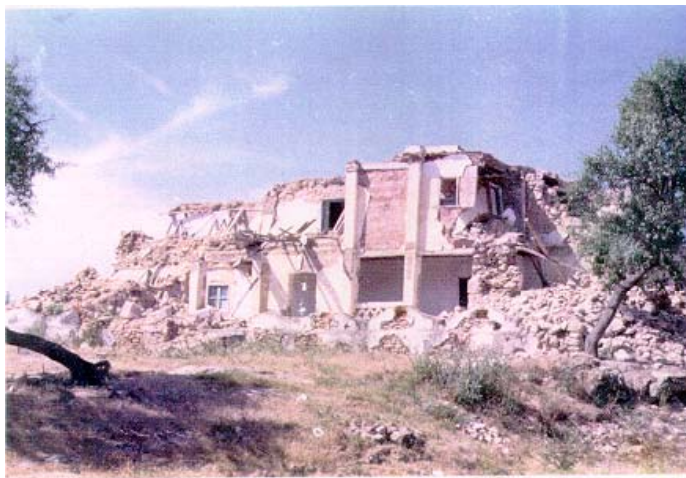
Fig. 7 – Total destruction of house in Izmourene.

in many cases (Fig. 7). In Rwadi, Beni Abdella; Ait Kamra, Izmouerne; Immezouren and Beni Bouaiych, there were small cracks in several walls in many cases and heavy damage in a few ones. The constructions by bricks suffered large cracks; few wall displacement (Fig. 8) and many cases of cracks with multiple directions in Rwadi; Izmourene; Immzeroune and Beni Abdellah and beni Bouaiych. In general, the older constructions in Al Hoceima city suffered small cracks observed in many cases, but few ones suffered heavy damage. But in the buildings little non-structural damage was noticed in few cases.