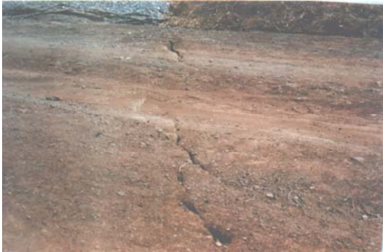
Fig. 3 – Fissures affecting ground in Tanda Ifran.